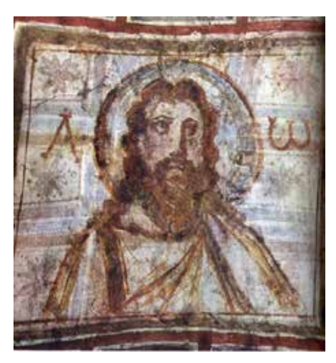
This image of Christ from around the time of Prudentius is from the catacomb of Commodilla in Rome. It features Alpha and Omega, the first and last letters of the Greek alphabet.

And eternal victory, evermore and evermore!