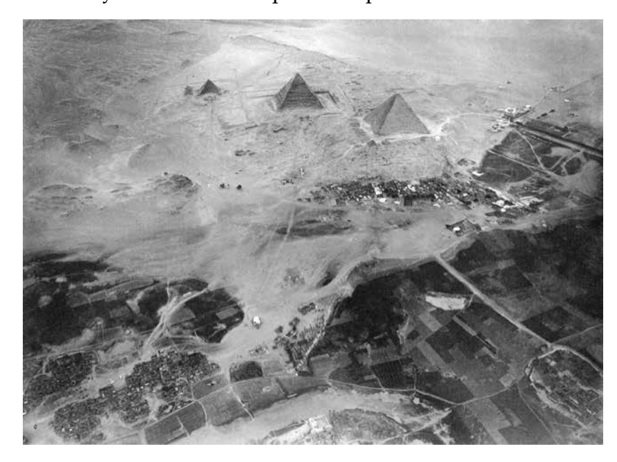
Eduard Spelterini took this photo from a balloon in 1904. The Great Pyramid is on the right.

they worked, and upon bread and clothing for the workmen, seeing that they were building the works for the time which has been mentioned and were occupied for no small time besides, as I suppose, in the cutting and bringing of the stones and in working at the excavation under the ground?