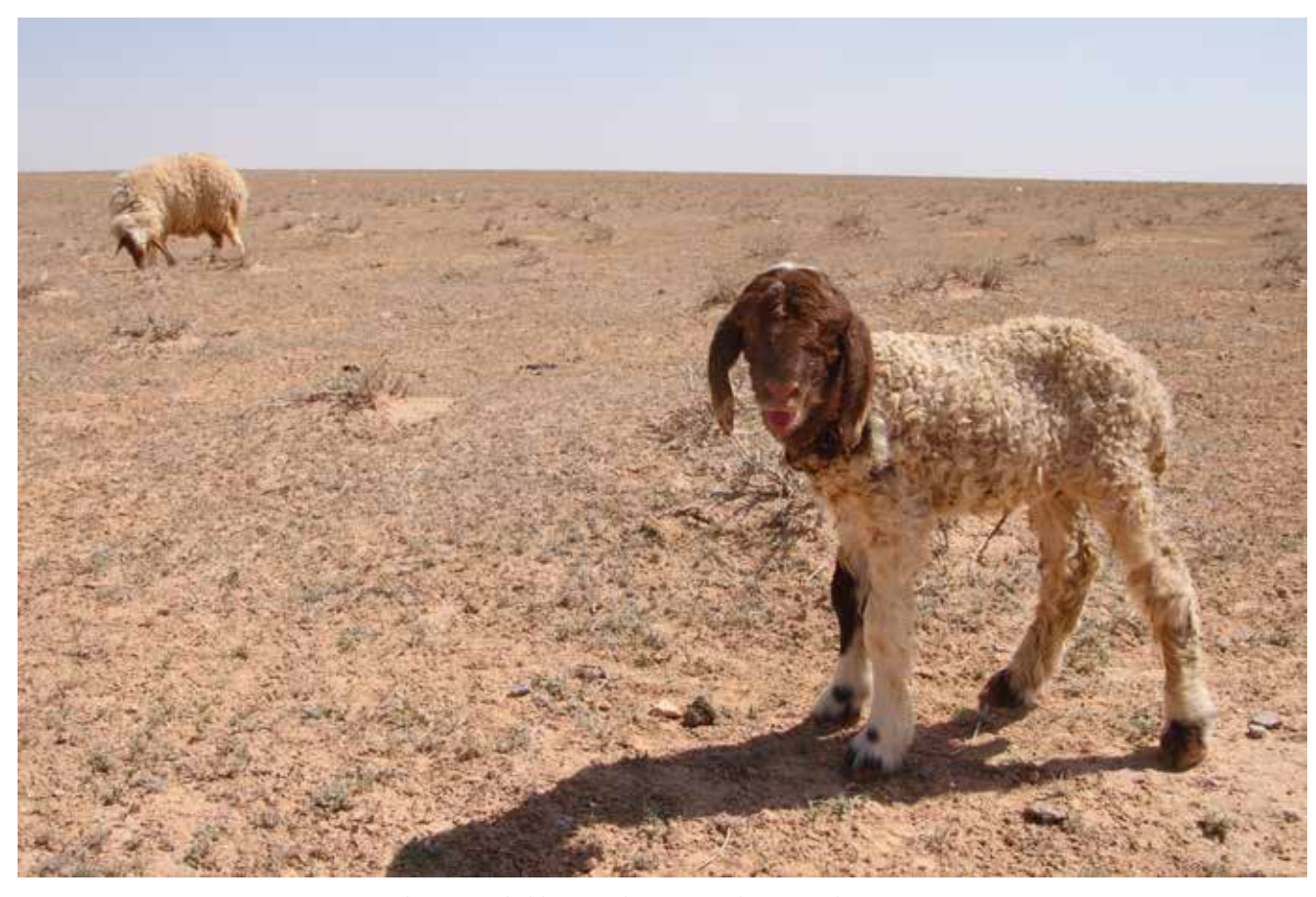
Sheep Herded by a Bedouin Family in Modern Syria

Three witnesses; Samsuiluna year 1, fourth month, 16th day.