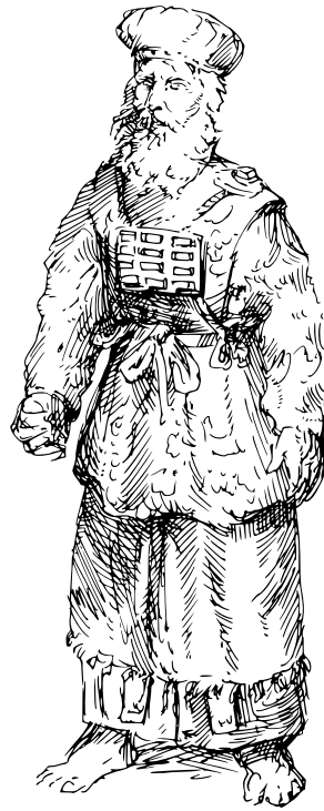
Jewish High Priest