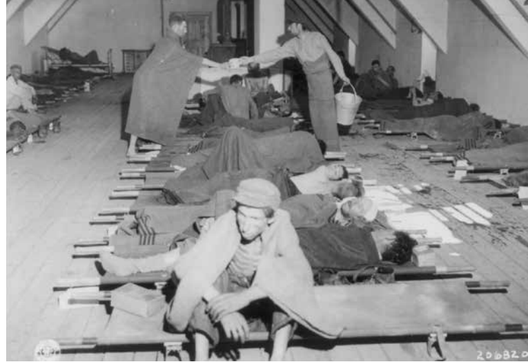
Allied troops released these Hungarian Jews from a Nazi concentration camp in 1945. This photo was taken at a U.S. Army hospital in Austria.

Holocaust Awareness Museum Philadelphia, Pennsylvania BestTrips.guide/hampa