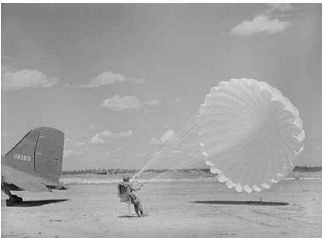
Airborne Troops Training at Fort Bragg, North Carolina, 1942

Fort Drum Museum Fort Drum, New York BestTrips.guide/fdmny