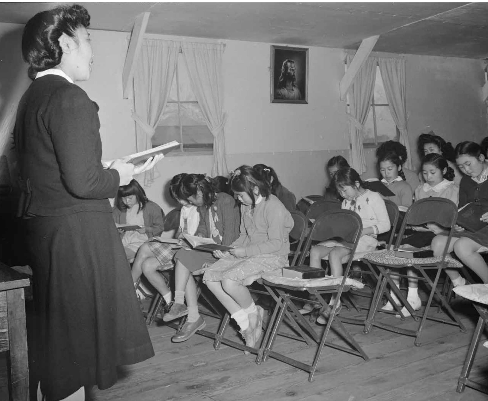
Sunday School Class at the Manzanar Relocation Center (1943).