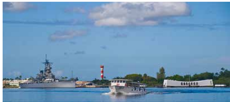
USS Missouri and USS Arizona Memorials

The WWII Valor in the Pacific National Monument features the USS Arizona memorial. Other sites are the Battleship Missouri Memorial, the USS Bowfin Submarine Museum & Park, and the Pacific Aviation Museum.