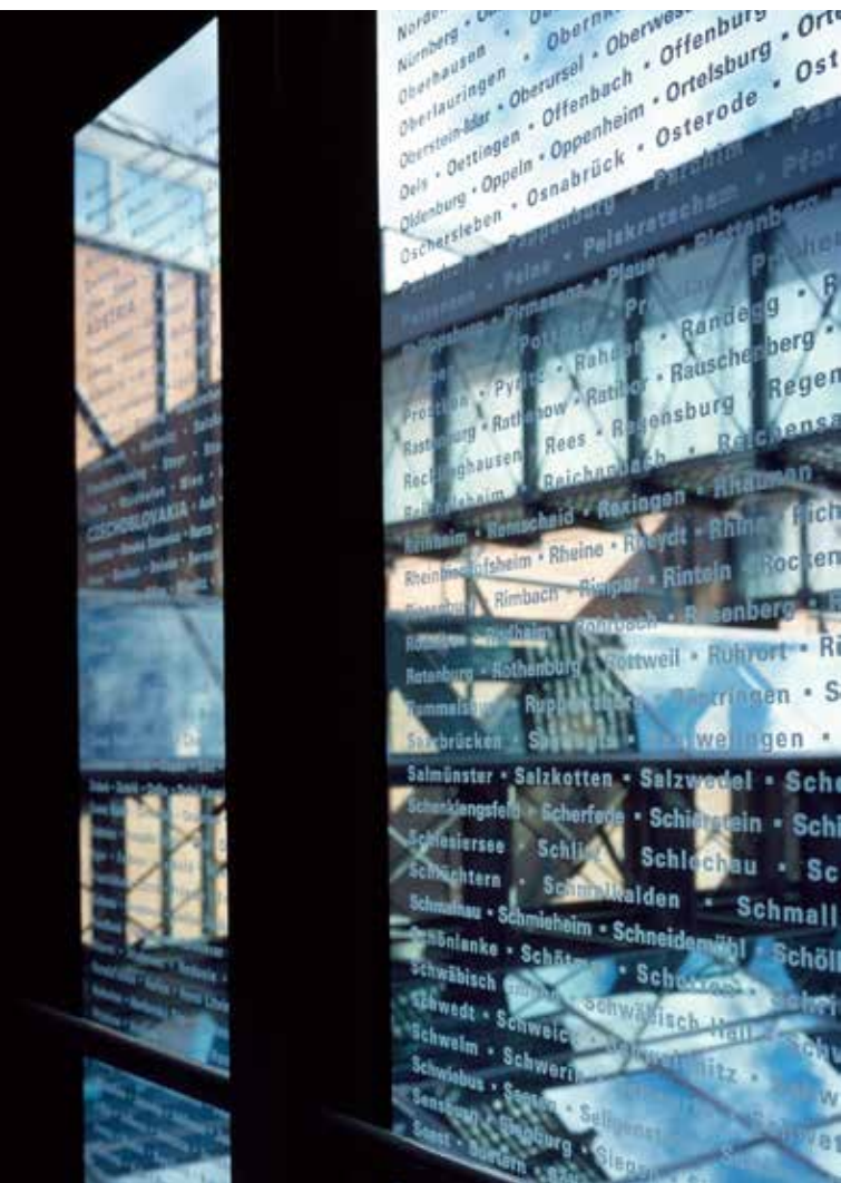
Names of Holocaust Victims at the Holocaust Memorial Museum in Washington, D.C.

Holocaust Memorial & Tolerance Center Glen Cove, New York BestTrips.guide/hmntny