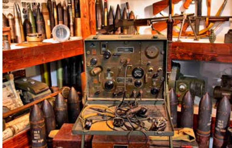
Radio Equipment and Ammunition at the Ropkey Armor Museum in Crawfordsville, Indiana