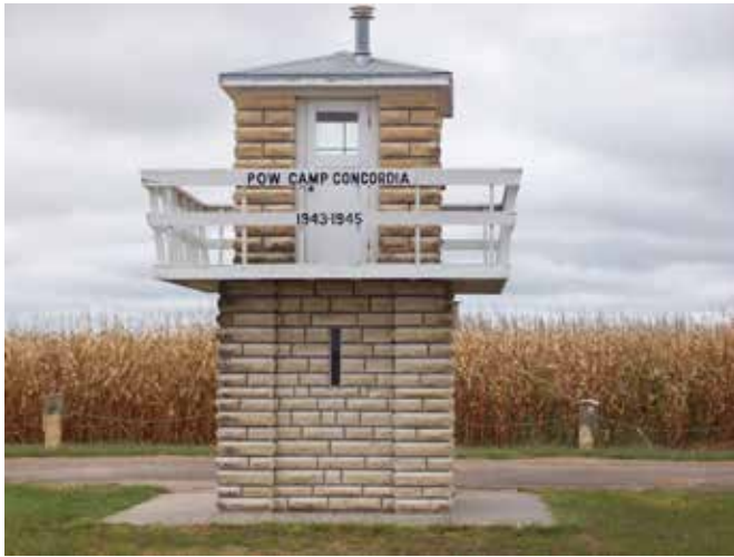
Restored Guard Tower, Camp Concordia, Kansas

Aliceville Museum Aliceville, Alabama BestTrips.guide/amaal