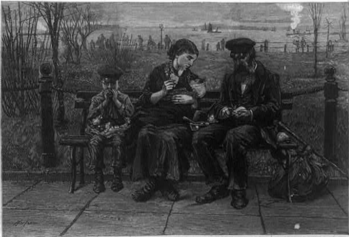
CASTLE GARDEN—THEIR FIRST THANKSGIVING DINNER.—DRAWN BY ST. JOHN HARPER.

This illustration from the November 29, 1884 issue of Harper's Weekly is entitled, "Castle Garden — Their First Thanksgiving Dinner." Castle Garden was the first stop for immigrants coming into New York City before Ellis Island was built in 1892.