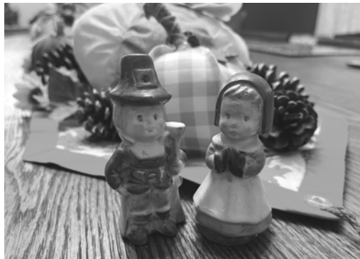
This Pilgrim couple has been part of our Thanksgiving celebration since the early 1980s.