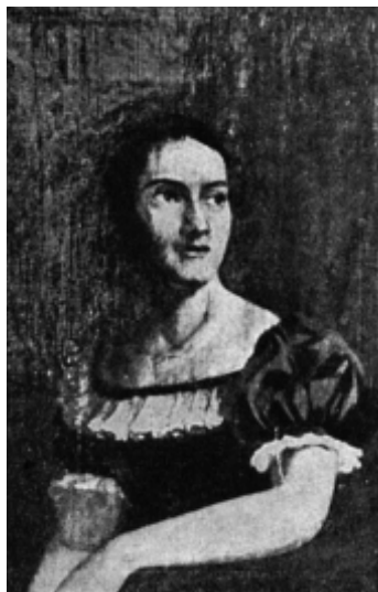
Lydia Maria Child

Lydia Maria Francis was born in 1802 in Medford, Massachusetts. Medford is the fourth oldest English settlement in the United States and one of the towns Paul Revere rode through when he announced that the British were coming during the American Revolution. Maria was taught at home, at a dame school, and at a women's seminary.