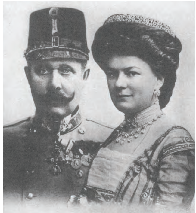
Franz Ferdinand and His Wife, Sophie

Following the assassination, Austria-Hungary made a list of ten demands on Serbia, mostly having to do with stamping out anti-Austrian propaganda. The demands as a whole were impossible to meet, but the Serbian government agreed to try to follow eight of them. This was not good enough for Austria-Hungary, which declared war on Serbia on July 28, 1914, and began a military move toward Serbia.