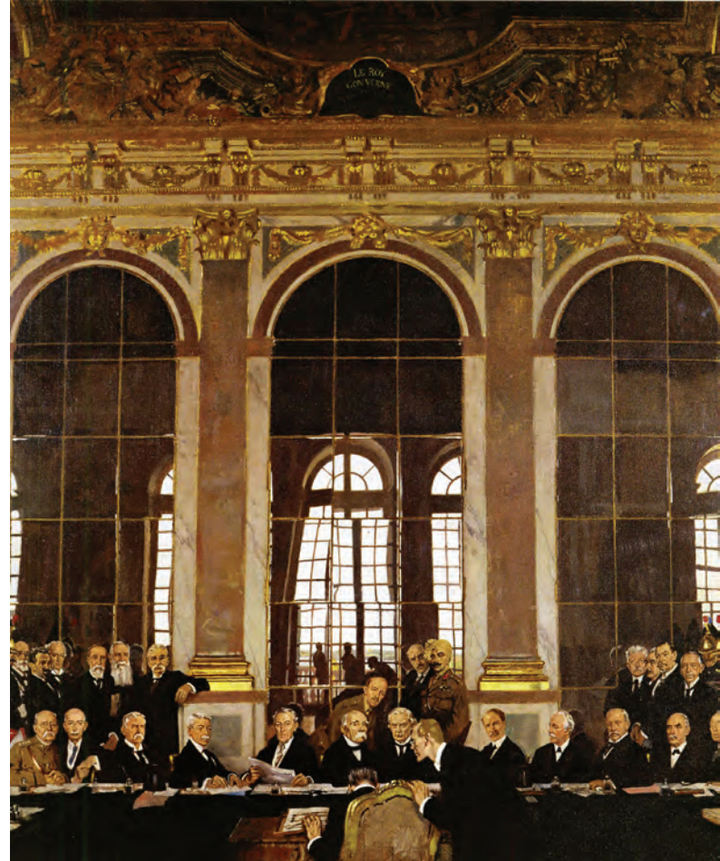
The Signing of Peace in the Hall of Mirrors, Versailles, 28th June 1919, William Orpen (Irish, 1919)

Wilson came home in July of 1919 to a nation divided over the Treaty of Versailles. The German-American community and the influential Hearst newspapers didn't like the harsh terms imposed