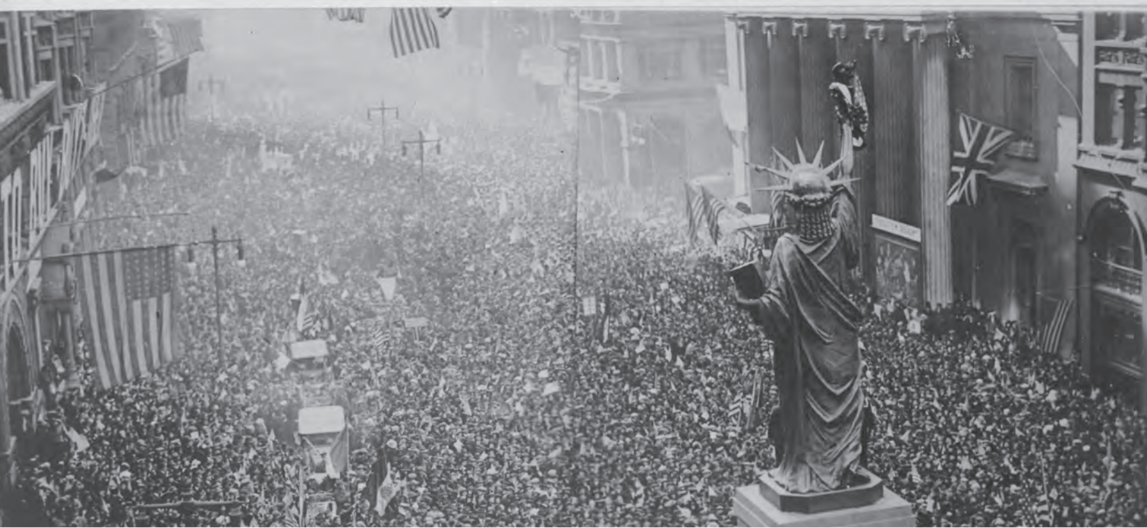
Americans Celebrate in Philadelphia After Announcement of the Armistice

of border questions involving European nations. He also called for national self-determination in the Balkans, Turkey, Poland, and other areas. The fourteenth point was a call for “a general association of nations” to guarantee independence and territorial integrity to all people. This became Wilson’s proposal for a League of Nations.