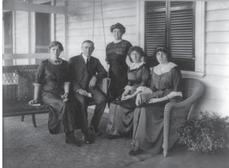
Woodrow and Ellen Wilson With Their Daughters Jessie, Margaret, and Eleanor (c. 1912)

The Democratic Congress responded to Wilson's leadership by enacting the Underwood Tariff of 1913. The new law reduced rates to a fifty-year low, cutting the average rate from around 40% to 29%. To replace the lost revenue, Congress also passed an income tax, something that had been enabled by the recently ratified Sixteenth Amendment. The income tax law set rates of one to six percent on incomes over $3,000 per year. The graduated income tax had