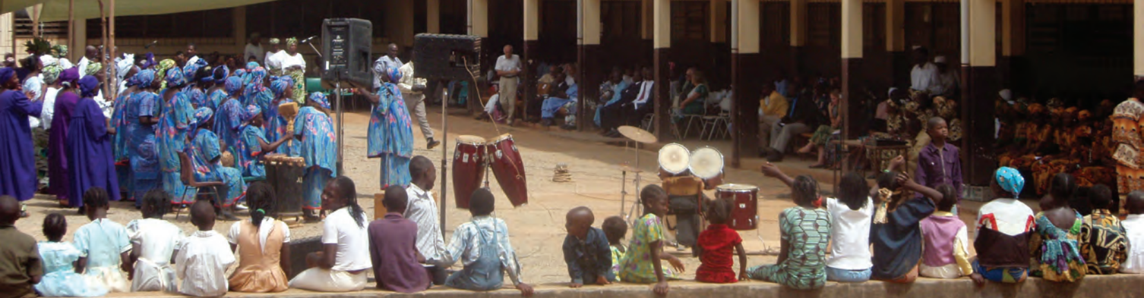
Church Service in N'Gaoundere, Cameroon (2007)