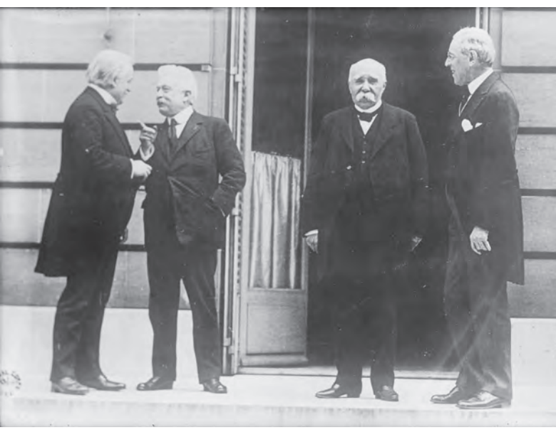
The Big Four at Versailles: David Lloyd George, Vittorio Orlando, Georges Clemenceau, and Woodrow Wilson

First, Wilson had to deal with the expectations that had been created by previously made secret treaties. When the Bolsheviks had taken over Russia, they had published the contents of secret treaties made by the Allies at the start of the war. These treaties called for the victor nations to carve up parts of Germany and Austria-Hungary and to take over Germany's overseas colonies. England, France, and Italy expected those agreements to be honored; but Wilson had strong objections to such actions, especially since they had been made in secret.