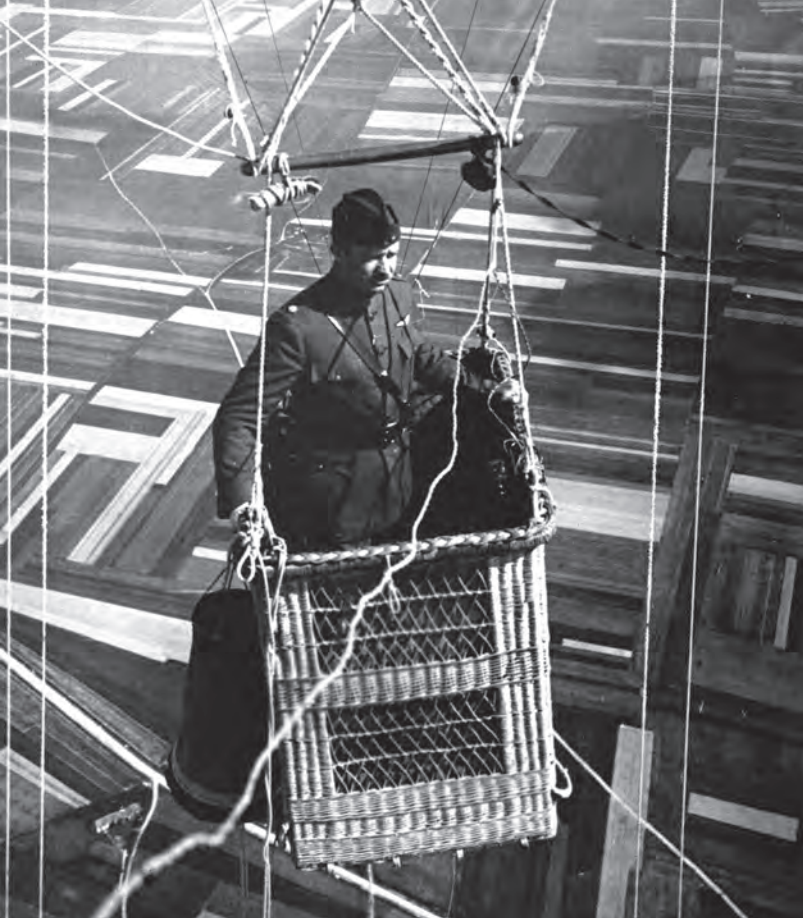
This American officer is in an observation balloon near the front lines in France (1918).

A significant portion of the American public opposed the war, and many prosecutions took place under the legislation. Over one hundred leaders of the Industrial Workers of the World were convicted for opposing the war effort. Socialist Eugene V. Debs also was against American involvement in the war. He was sent to jail for encouraging men to resist the draft. While in prison, he received over 900,000 votes for president in 1920.