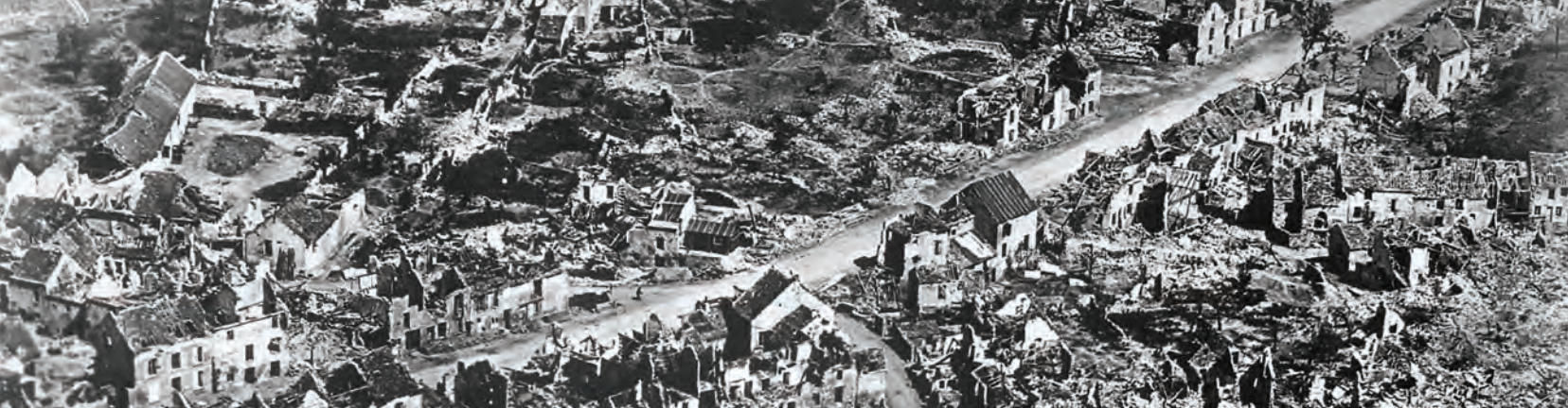
Ruins of Vaux, France (1918)