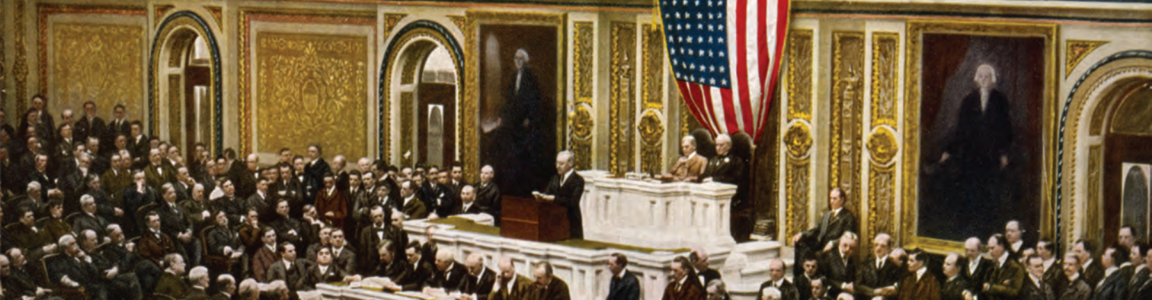
Woodrow Wilson Asks Congress for a Declaration of War