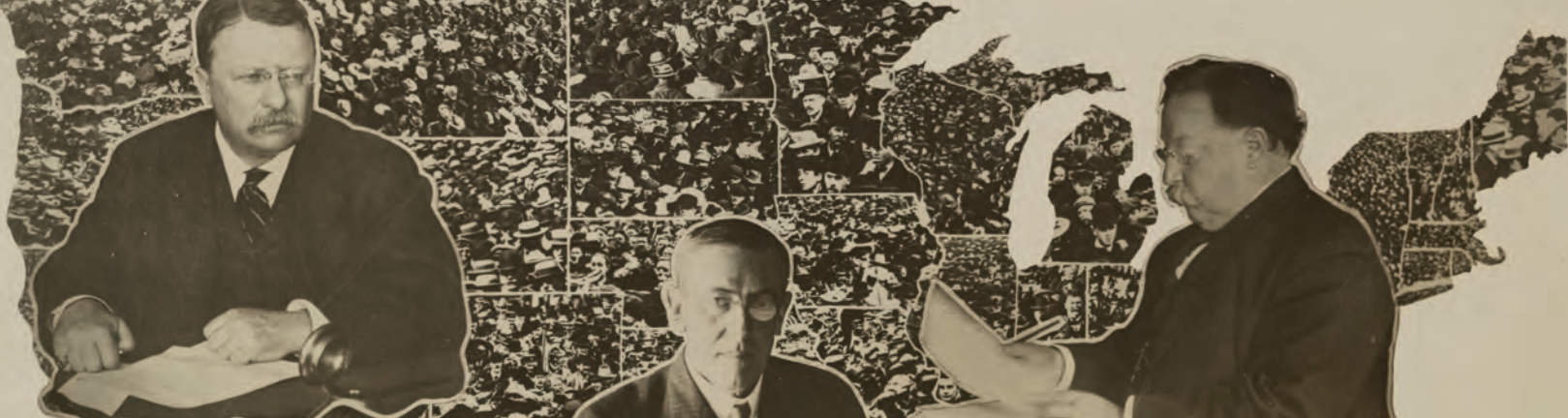
1912 Campaign Poster Showing Roosevelt, Wilson, and Taft