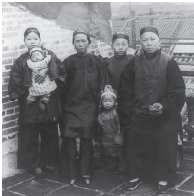
A Chinese Christian Pastor and His Family (c. 1900)

Chinese Christians have even been leaving China to serve as missionaries in other countries. The picture of faith in China is complicated because China itself is complicated; but God is definitely moving in the People's Republic of China.