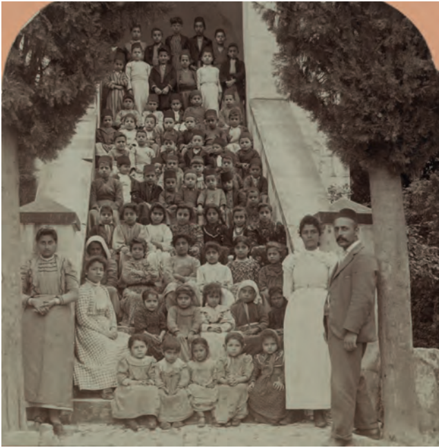
This 1903 photo shows the Christian Mission School in Nablus, Palestine. Today Christians in Palestine are among the most active worldwide in sending out international evangelists.

Paul declared that he was going to teach the Gentiles. Many Gentiles responded joyfully (Acts 13:46-48).