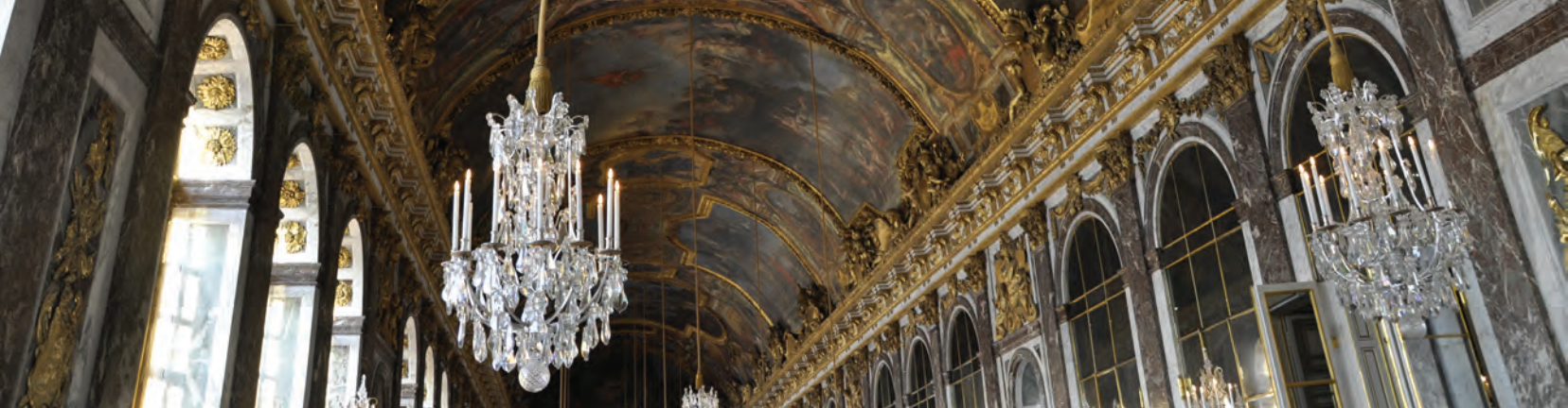
Hall of Mirrors at the Palace of Versailles