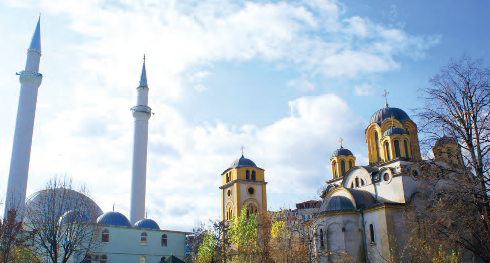
Mosque and Church in Ferizaj, Kosovo

In addition, Americans have tended to be condescending toward people of other nations and other ethnic groups. It was common for Americans to refer to the people of the Philippines, for instance, as “our little brown brethren” or to use other such belittling phrases. Many mission efforts tried to keep control of their work in the hands of western missionaries, who were thought to be more intelligent or more reliable than the native peoples. In more recent times, missionaries have concentrated on training local men to be preachers who can take the gospel to their own ethnic groups; and this approach has generally been more effective in reaching the lost.