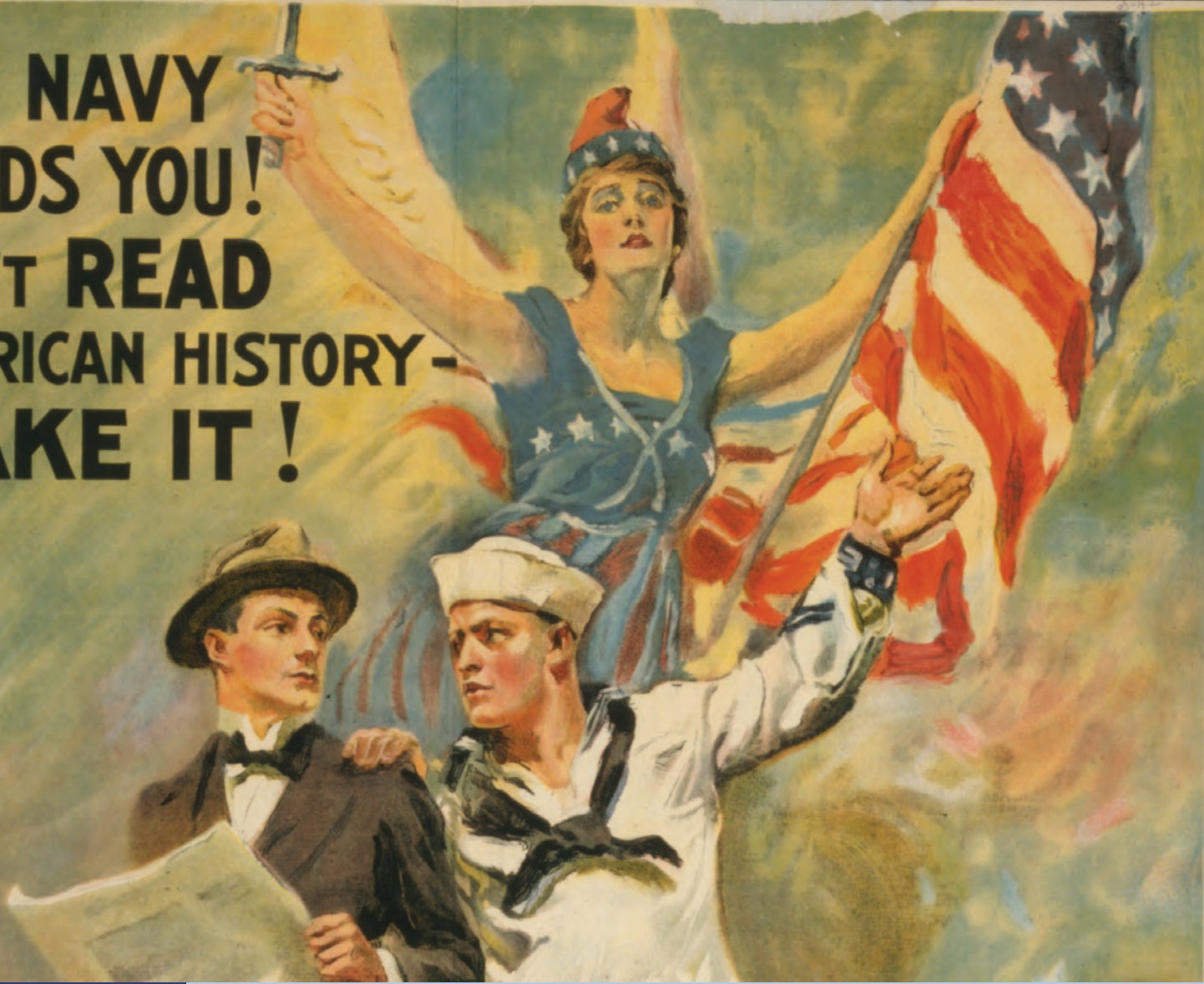
U.S. Navy Recruiting Poster (1917)

THE NAVY NEEDS YOU! DON'T READ AMERICAN HISTORY - MAKE IT!