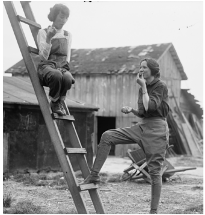
War Gardeners, 1919