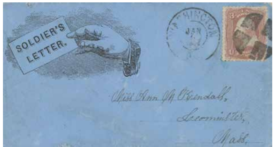
Envelope Mailed During the Civil War