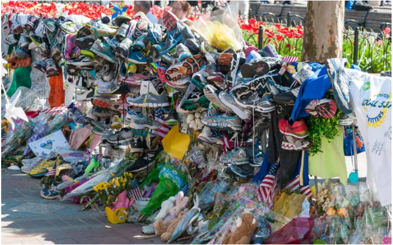
Memorial in Boston for the Victims of the 2013 Boston Marathon Bombing