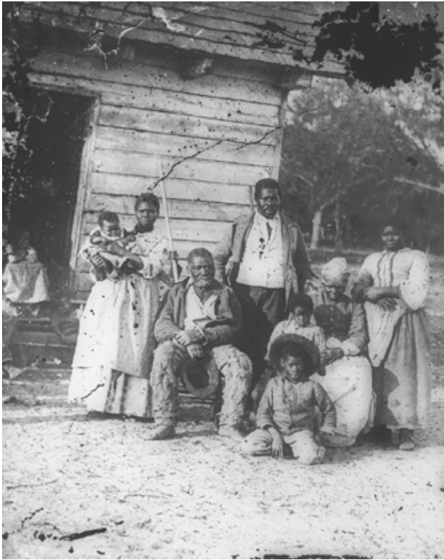
Four Generations of a Slave Family in Beaufort, South Carolina, 1862