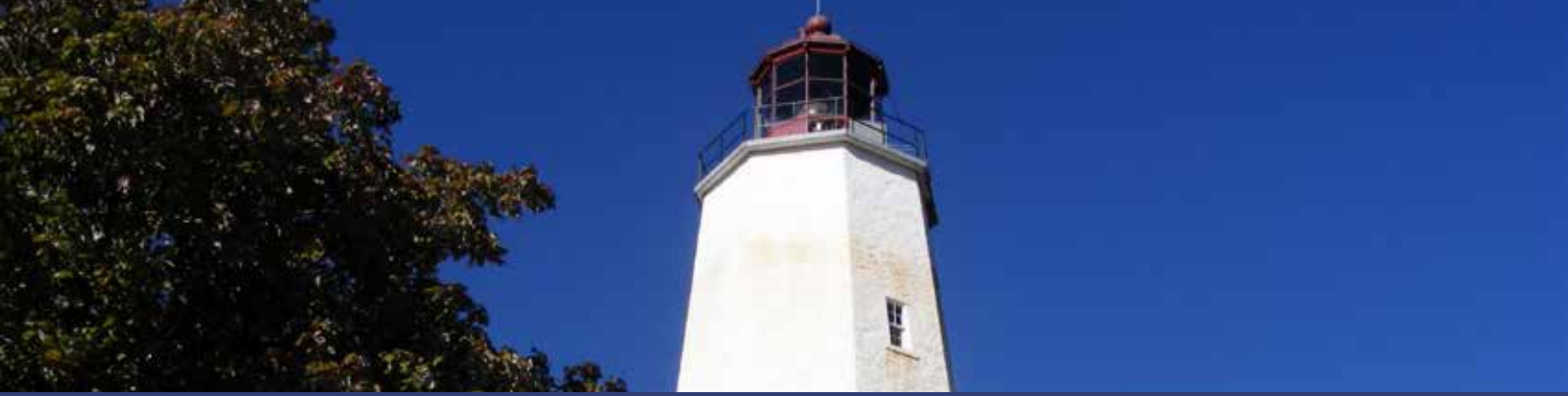
Sandy Hook Light, New Jersey, Built in 1764