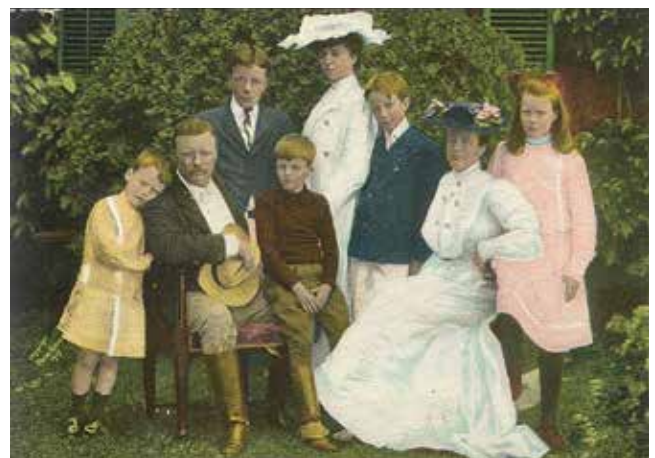
President Theodore Roosevelt and Family, 1903