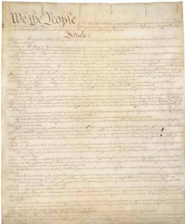
First Page of the U.S. Constitution, 1787