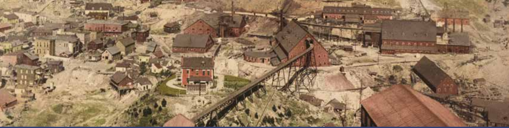
Homestake Gold Mine in Lead, South Dakota, 1900