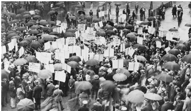
Crowd Outside Bank in New York, 1931