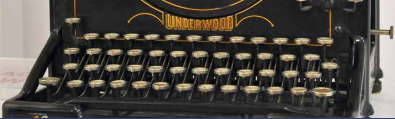
Underwood Typewriter from the Early 1900s